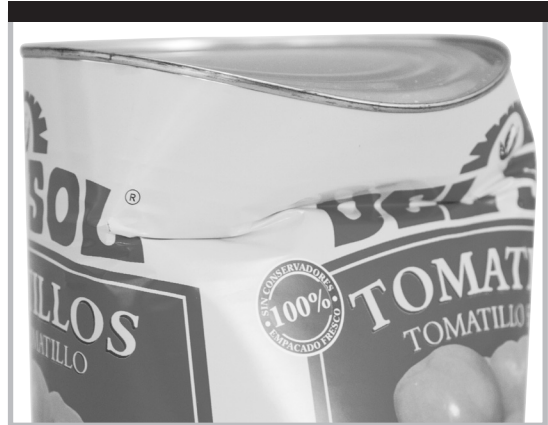
Deep dents in can body