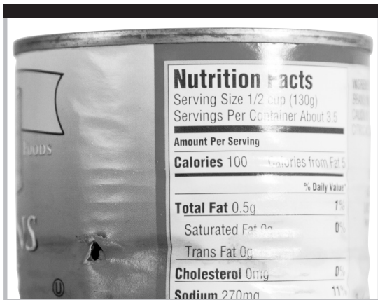
Holes or signs of leaking