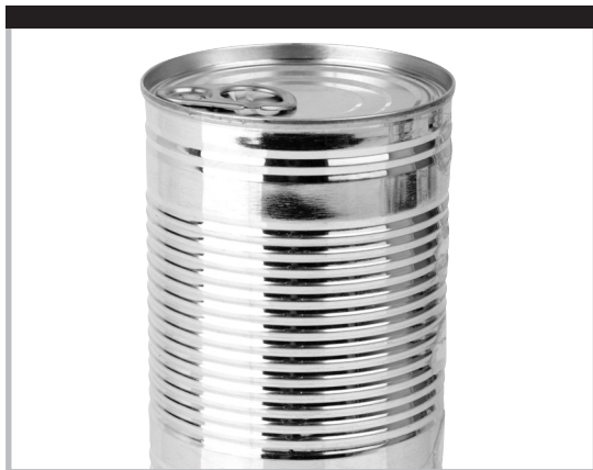
Missing or unreadable labels