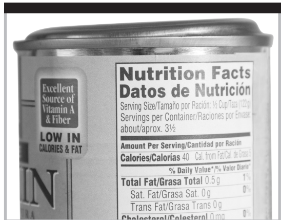
Swollen or bulging ends