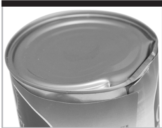
Severe dent in seam